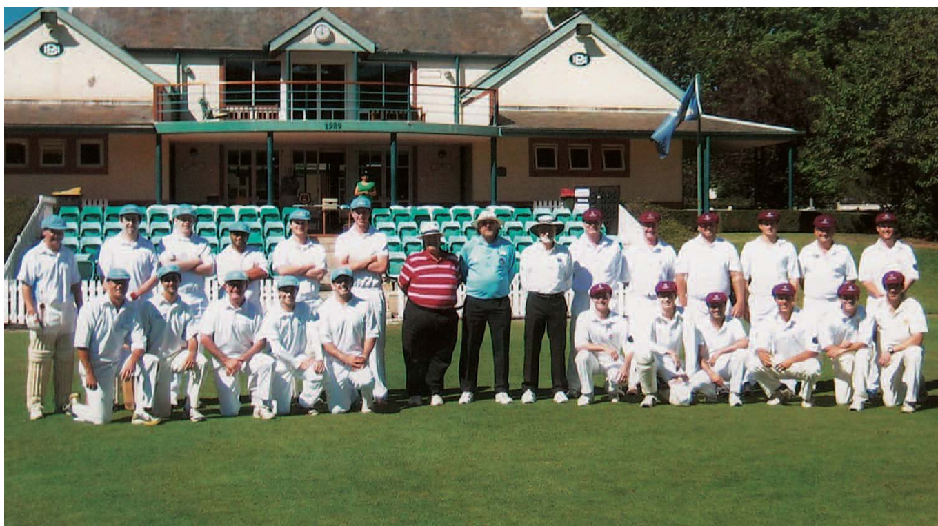
New South Wales & Queensland

New South Wales defeats Queensland Bradman Oval January 2014