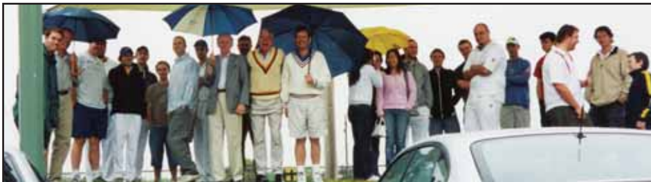
The Rainmakers waiting in vain

Next year Water Polo will be on the agenda. Your cricket correspondent 2004